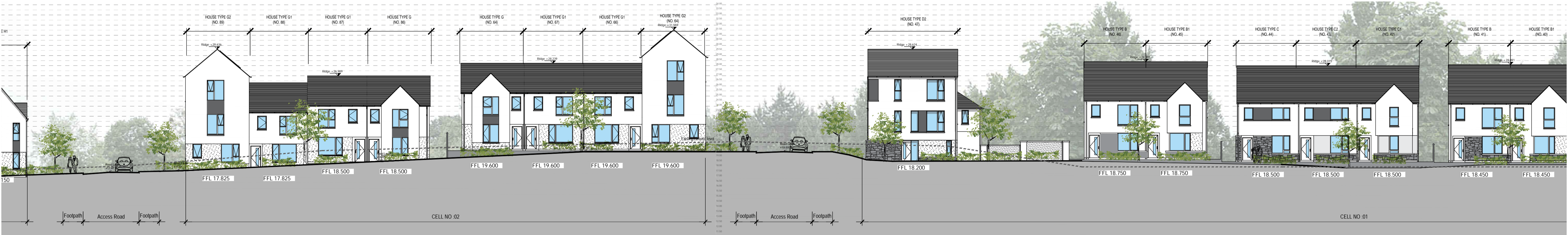
03 Site Context Elevation A-A PART 2 Scale: 1:200