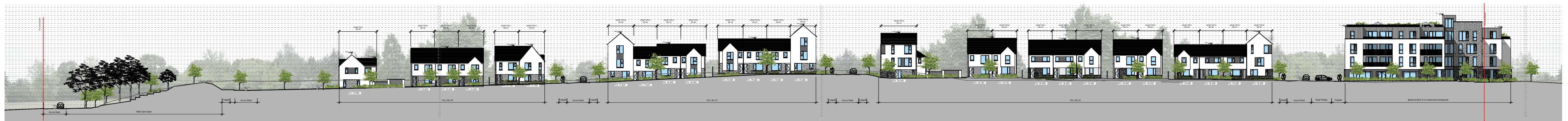
01 Site Context Elevation A-A Scale: 1:500