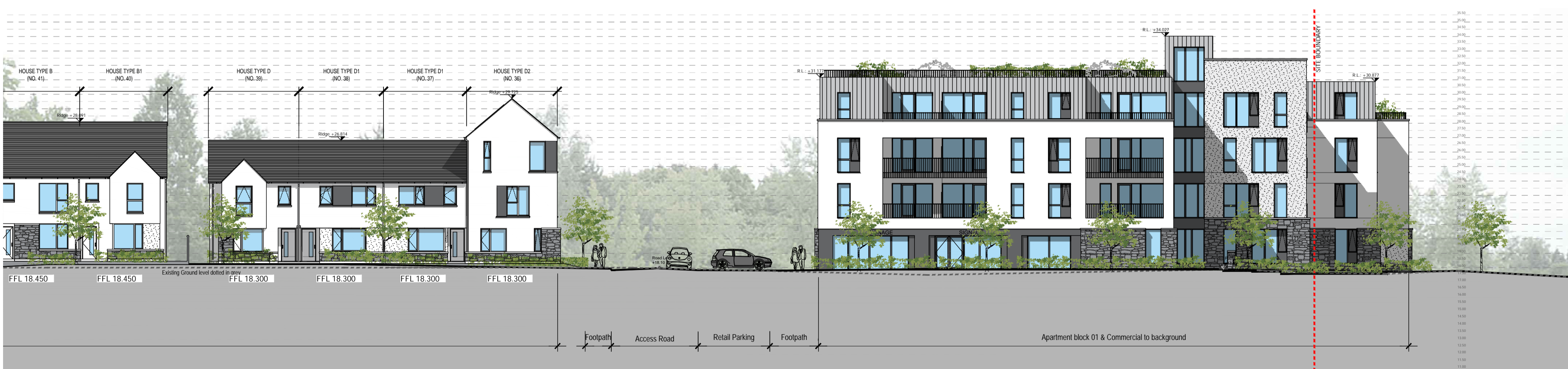
04 Site Context Elevation A-A PART 3 Scale: 1:200